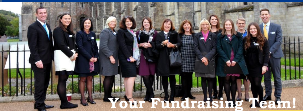
Your Fundraising Team!

Next year, Hospice costs will rise - that's a fact.