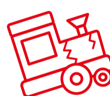
TOYS + GAMES